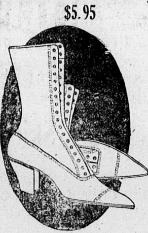
Havana Brown Kid, medium high and low heels. Sizes 2 1/2 to 6.