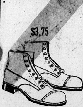
Boys "Boston Boy" solid box kip boots. Sizes 1 to 5.