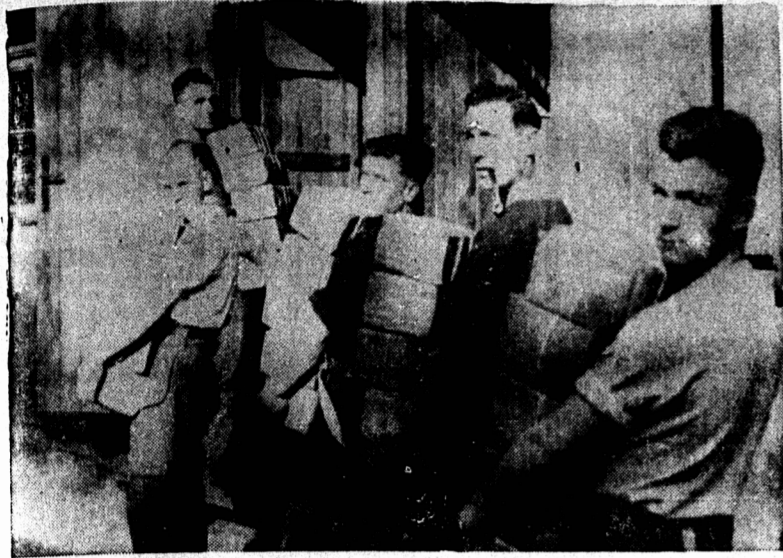
Red Cross food parcels arrive at a German prison camp in Germany, Occupied France, Italy and Africa since the outbreak of war. Present output is 100,000 each week from five Red Cross packing depots in Canada.