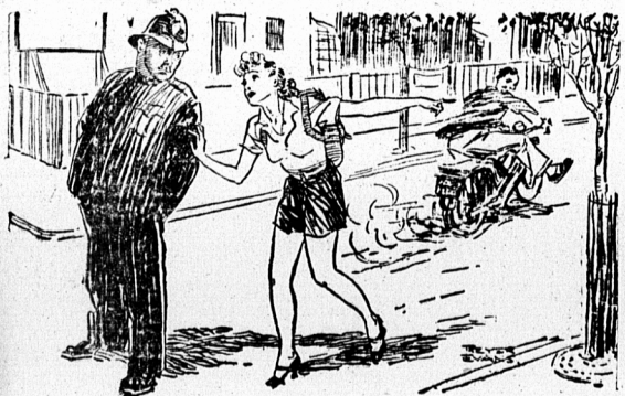
"Stop that man! He wanted to kiss me!" "That's all right, miss. There'll be another along in a minute." —Humorist.

been indisposed since early this year. In the absence of Hon. T. A. Crerar, who is ill, Works Minister Cardin will administer the department of mines and resources. Mr. Crerar is expected to be back at work within a week. Fisheries Minister Michaud will be acting Minister of Agriculture in the absence of Hon. J. G. Gardiner who is on a holiday at the Pacific coast.