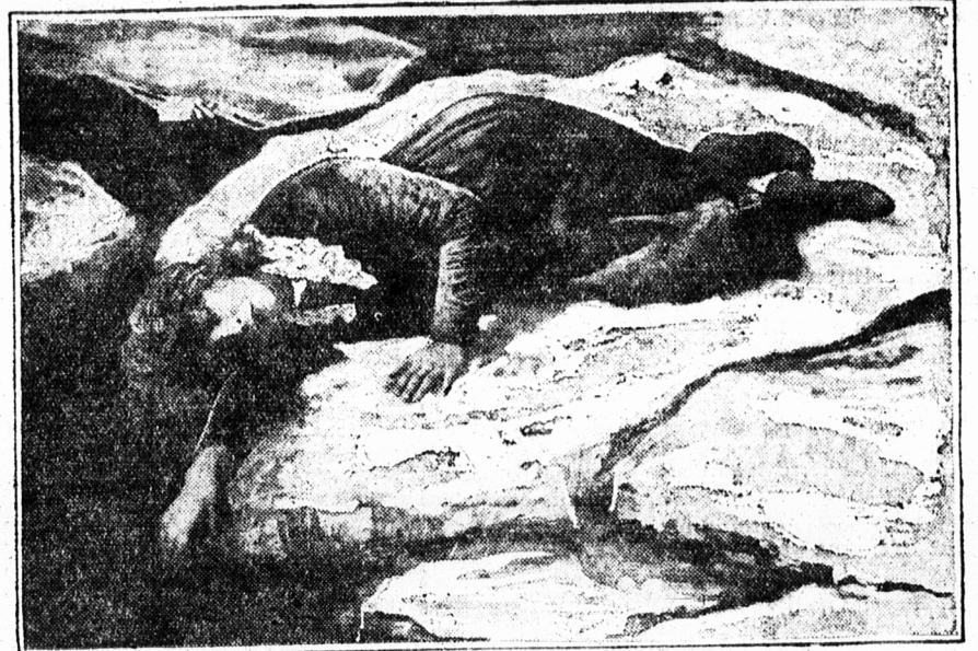
ONE OF THE MANY THRILLING SCENES IN D.W. GRIFFITH'S "WAY DOWN EAST"

MATINEE DAILY AT 2.30 SHARP. DOORS OPEN 1.45 EVENING PERFORMANCE AT 8.15 SHARP. DOORS OPEN 7.15