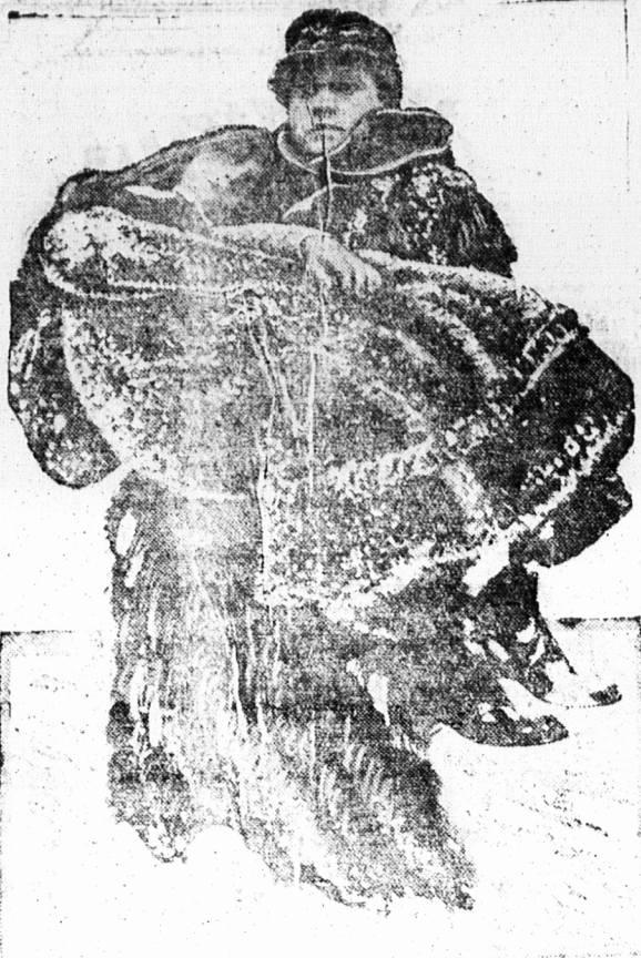
LILLIAN GISH & RICHARD BARTHELMAS in D.W. GRIFFITH'S "WAY DOWN EAST"

$10.00 WAS PAID FOR THE BEST SEATS FOR "WAY DOWN EAST" ON ITS PREMIER PRESENTATION IN NEW YORK