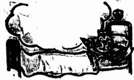
ROUTINE NURSING SERVICE