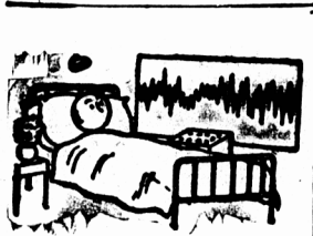
BED AND BOARD