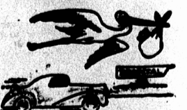
50 per cent Maternity Bill - In To 12 Days

HOSPITAL CARE IN ANY RECOGNIZED HOSPITAL ANYWHERE