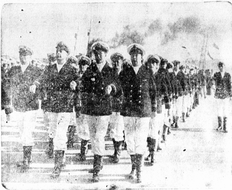
Officers of the Royal Canadian Naval Volunteer Reserve at one of the R. C. Naval training stations on the East Coast...