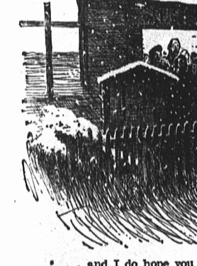
... and I do hope you chaps don't think there was anything funny about the draw, just because I organized it." —Humorist.

Improvement of 1-32 of a cent was shown on Montreal foreign exchanges today by Pound Sterling at $4.71 1-16. The United States dollar declined 1-32 to 27-32 premium while French franc eased narrowly to 2.65 31-32 cents.