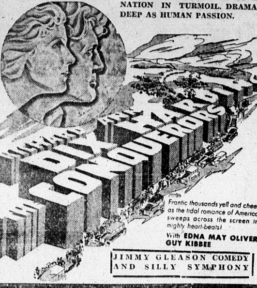
Frantic thousands yell and cheer as the tidal romance of America sweeps across the screen in mighty heart-beats! With EDNA MAY OLIVER GUY KIBBE JIMMY GLEASON COMEDY AND SILLY SYMPHONY

MATINEE 3.15-16c, 26c. NIGHT 7 & 8.45-26c, 37c, 45c. A SOUL-STIRRING HUMAN STORY ROLLING ACROSS THE SCREEN IN THE MIGHTY HEART BEATS OF A NATION IN TURMOIL. DRAMA DEEP AS HUMAN PASSION.