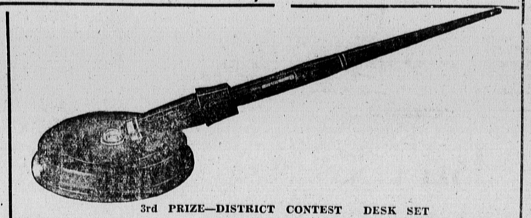
3rd PRIZE-DISTRICT CONTEST DESK SET