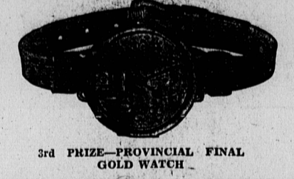
3rd PRIZE-PROVINCIAL FINAL GOLD WATCH