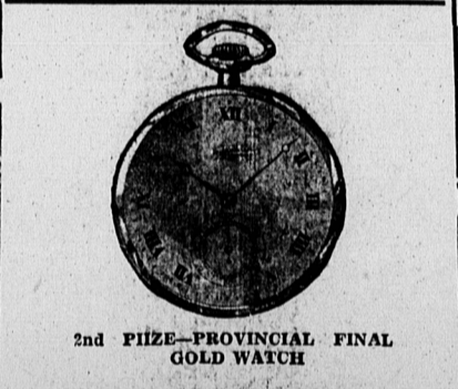
2nd PRIZE-PROVINCIAL FINAL GOLD WATCH