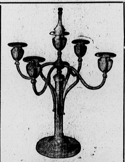
1st PRIZE-PROVINCIAL FINAL SILVER CANDELABRA

Prizes may be seen in windows of W. W. WELLNER, LTD., Charlottetown