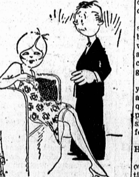
He: You evidently think money grows on trees. She: Well, it comes from the sap usually.

After the last case had just been heard in a police court at Buckingham, England recently, it was found that all the witnesses had been taking the oath on a prayer book instead of the Bible.