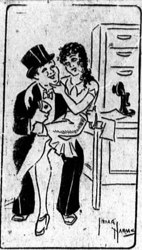
The most popular labor saving device for typewriters is the touch system.