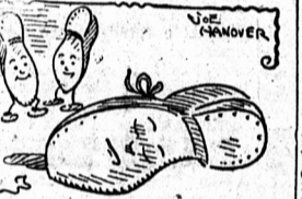
KIND WORDS 1st Shoe: He was a pretty good chap. 2nd Shoe: Yes, he was a 'whole-sold' fellow!