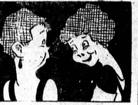
WHY SHE MARRIED HIM "Sophie, why did you ever marry an ex-convict?" "They're so accustomed to staying in, my dear."