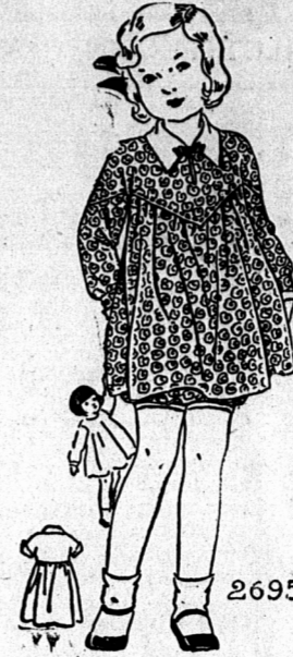
Stacks of little washing frocks for the wee ones. She can't have too

many when the warm days arrive. And here is one that is as smart as it is practical. It is completed by bloomers with knee bands. It can be made with long or short sleeves. If the latter, you have only to line the point and turn it up.