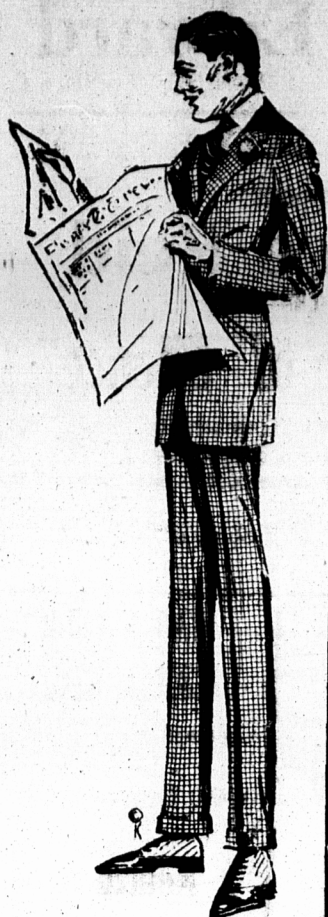
Men's Soft Hats

From the best makers; our stock of men's Soft Hats comprises the very latest in patterns and shapes, the color range comprises brown, green, grey and black, these hats are manufactured by such celebrated makers as Wolthausen, Borsalino, Stetson and others.