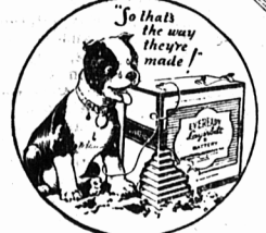
Owning and operating Eveready Battery Station CKNC, Toronto