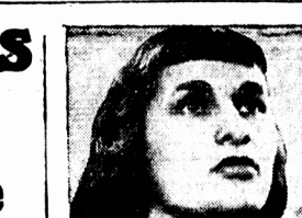
WINS SCHOLARSHIP. GETS TRIP TO U. K.

The Bureau's report dealt ex- tensively with Canada's export trade and the effect of E.R.P. on it. Continued in the monthly statistical review. It also noted a United Nations progress report on the world economic position.