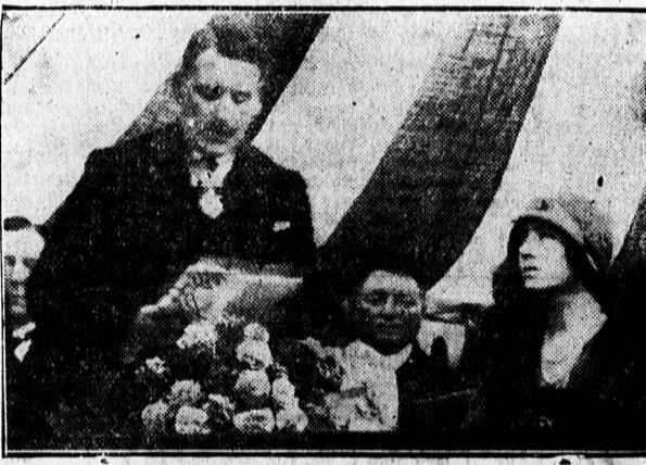
THE DUCHESS OF YORK OPENS A CHILD WELFARE CENTRE AT HACKNEY

"The Little Duchess" as she is called in the United Kingdom, caught by the photographer in an unusually pensive mood, at the ceremonies in connection with the opening. She is much in demand for such events everywhere.