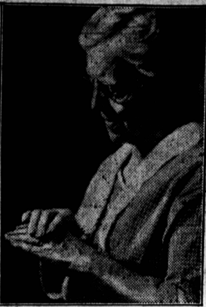
Tells of quick relief to aching, swollen joints