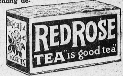
In Sealed Packages Only

They preserve flavor, freshness and strength — insuring value for the money.