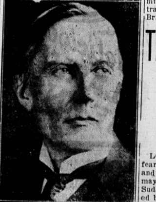
RT. HON. H. A. L. FISHER

Who was President of the Board of Education in the Lloyd George Cabinet, is in Canada on a visit. In an address before a Toronto audience he expressed the opinion that India had not reached the state when the Government of the country could be safely entrusted to the natives. In this movement he sees danger of chaos and bloodshed.