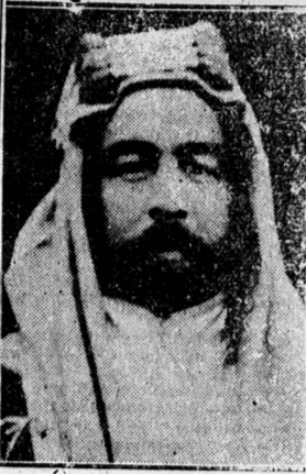
RECRUITING AN ARMY

LIVE POULTRY WANTED.—S. R. Pendleton will be buying heavy live fowl and chickens, Monday, Oct. 13th at the Brunswick Hotel, Kensington. 6945-10-11-M81.