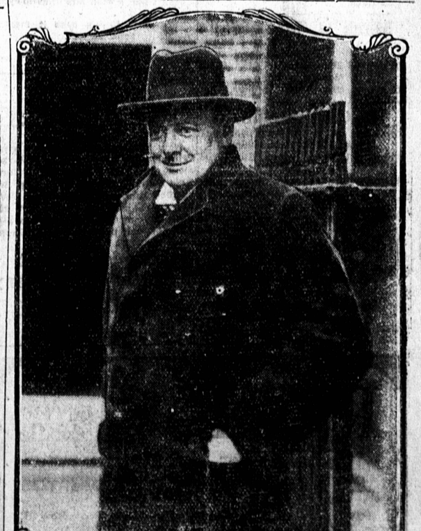
Winston Churchill, chancellor of the British Exchequer, is shown in a late photo leaving Downing St. despite the coal strikes and kindred evils.

CHICAGO, Oct. 22.—The condition of Eugene V. Debs, internationally known socialist, ill at a sanatorium at Elmhurst, Ill., was reported critical tonight by his physician. The former socialist candidate for President has been confined at the sanatorium for a month suffering from a nervous breakdown.