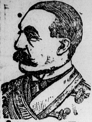
THE EARL OF MINTO