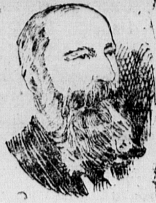
KING LEOPOLD OF BELGIUM

EMPERESS OF CANADIAN PACIFIC ATLANTIC STEAMSHIPS