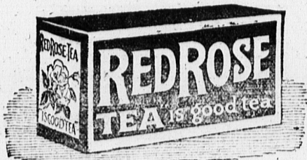
Red Rose Coffee is as generously good as Red Rose Tea

The Red Rose name guarantees satisfaction.