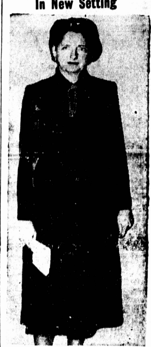
Elizabeth Bentley, self-confessed member of a Communist spy ring, who repented and exposed the espionage activities of her former comrades in a congressional investigation, is shown just before she spoke in the Christian culture lecture series at Aquinas Institute, Rochester, N. Y. Miss Bentley recently followed the example of Louis Budenz and embraced Catholicism.

(a) Construction of a single lock — locks would conform with those of the Welland ship canal — below Victoria Bridge to overcome a difference in water levels.