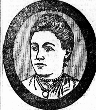
This woman says that Lydia E. Pinkham's Vegetable Compound cured her after everything else had failed.