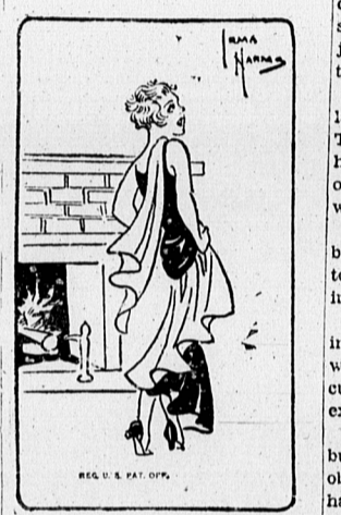
"A flapper silhouetted against the fireplace makes a grate showing."