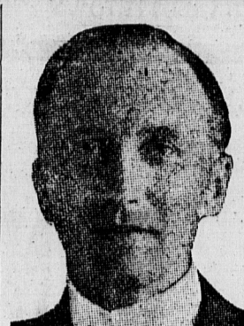
SIR JOHN SIMON