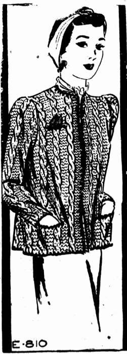
DESIGN NO. 810

Here is an ideal sweater knitted in the easy-to-do cable stitch with long or short sleeves. Size 32 to 42. Pattern No. 810 contains complete instructions. To order: Send 20 cents in coin to Needlework Bureau, Charlottetown Guardian. Design No. 810