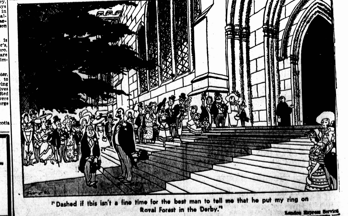
"Dashed if this isn't a fine time for the best man to tell me that he put my ring on Royal Forest in the Derby."