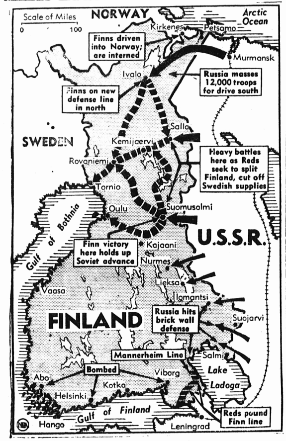
Burging into north central Finland on three fronts, the Russian army reveals the strategy of its attack centered on control of Tornio, key city on the Gulf of Bothnia. Heavy arrows indicate extent of Red advance and broken lines show routes Soviet troops seek to follow in their drive to cut Finland in half.