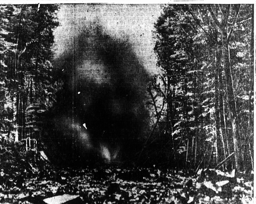
German shell, pictured at the moment of explosion, cuts a great swathe through trees that situated a French position between the Maginot Line and the German Westwall.