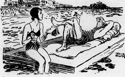
"Now swim ashore and type those out, and when you come back bring me the telephone." —London Opinion.