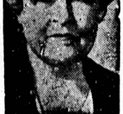
Man on the Spot