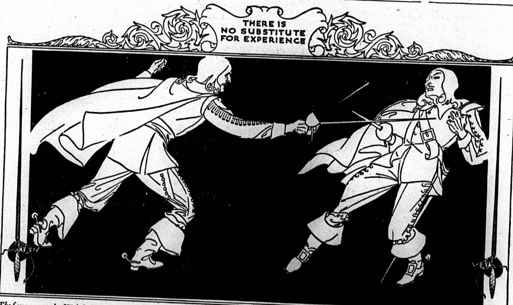
The famous swords of Toledo, Spain, unparalleled throughout Europe for the keen flexibility of their blades and the rich beauty of their hilts. These are no overnight achievements in metal. They represent the combined experience of centuries of skilled sword makers. They prove that there is no substitute for experience.