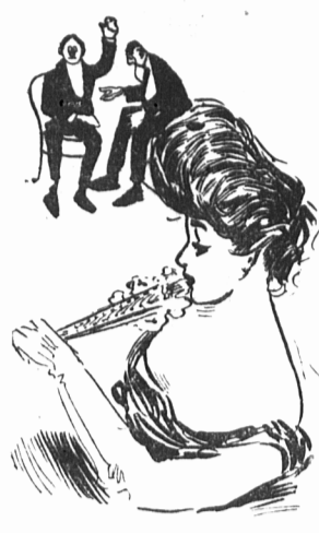
AT THE MUSICAL.

We know that British statesmen will avoid war if it can honorably be avoided.