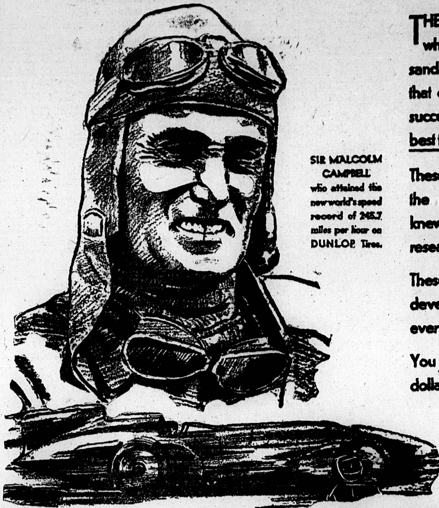
SIR MALCOLM CAMPBELL who attained the new world's speed record of 242.7 miles per hour on DUNLOP Tires.

THEY hurled challenges to Death—these men who rode meteoric monsters of metal on the sands of Daytona. Campbell, Segrave—they knew that only perfection in every detail would make success possible. Above all the fires had to be the best that could be made. They chose DUNLOPS.