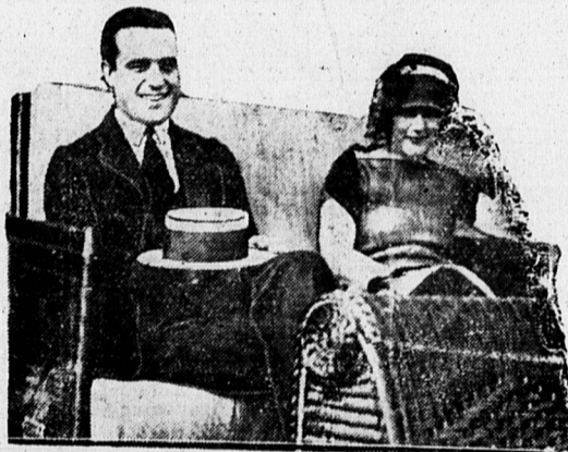
Photo shows Harold Lloyd and his leading lady bride, Mildred Davis, whom he won many times in his various screen productions, finally to lead her to the altar in real life. The couple are honeymooning at Atlantic City.