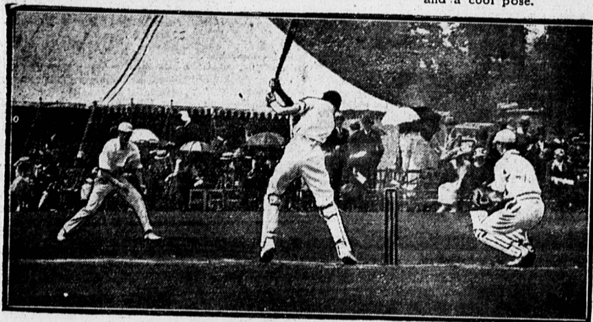
An incident in the game of the first day's play of the annual cricket match between Eton and Winchester. The game was left drawn after two days' play.