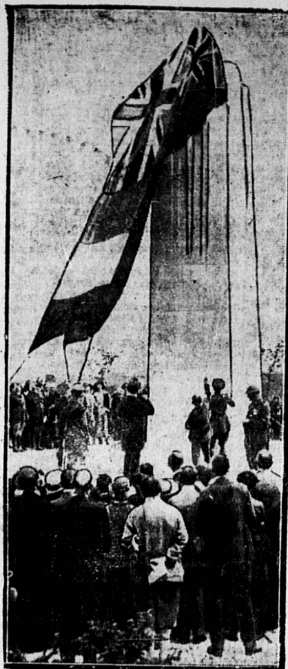
The Duke of Connaught unveiled the war memorial in honor of the Canadian troops who fell at Ypres. The monument is the gift of the Canadian Battlefields Committee.