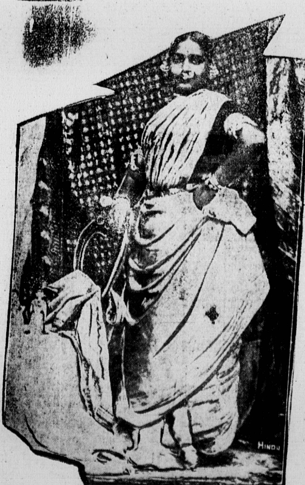
The Deva Dasi of India is the dancing girl—the darling of the temple. She is trained from childhood for her profession to sing and dance before the god to whose temple she is dedicated.