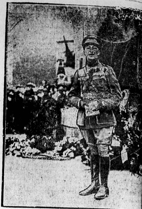
France and England joined in homage to the memory of Georges Guynemer, greatest of allied air heroes, when a memorial was dedicated at Poelcapelle. Guynemer died after downing fifty-three enemy planes.