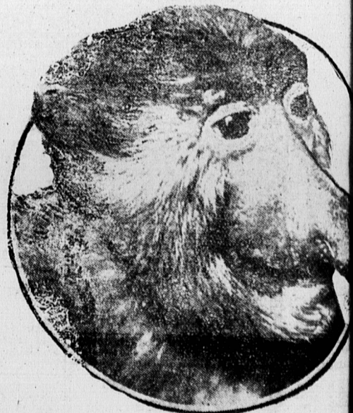
Can you imagine this big nose monkey of Borneo being killed by a bad case of hay fever. This is the only one alive in captivity.