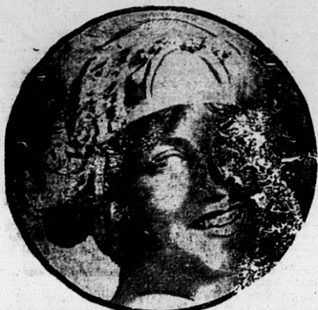
Lillian Lorraine, musical comedy and vaudeville star, has been compelled to sell great quantities of her jewelry and now declares herself bankrupt. Some time ago she fell while dancing and injured her spine.