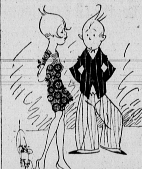
"Jack is awfully absent minded." "How so?" "He scratched his wife and kissed a match the other night."