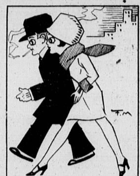
GOBS OF 'EM "Did you ever love a sailor?" "Yea, gobs of 'em."