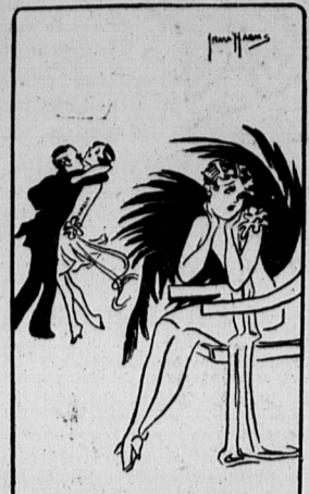
"The girl who sits while others dance, stands in her own light."