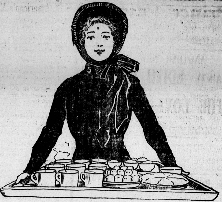
The Salvation Army Lassic.