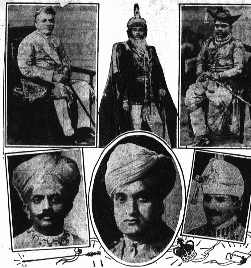
Top, Maharajah of Baroda, M-harajah of Nepal, Maharajah of Gwalior. Lower, Maharajah of Mysore, Maharajah of Kashmir, N-lan of Hyderabad.

World's Richest Men To Be Honored At Delhi