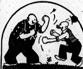
The Morning After Taking Carter's Little Liver Pills