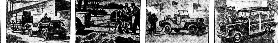
IN INDUSTRY... The Universal 'Jeep', with its tractor power and extra strong frame specially built for towing, lends itself to many uses in the factory. AS MOBILE POWER UNIT... The versatile 'Jeep', fitted with power take-off furnishes power for the operation of many types of spline shaft and belt pulley equipment. FOR SPECIFIC INDUSTRIAL USES... Operated by the 'Jeep' centre power take-off, this light weight, portable air compressor operates many pneumatic tools. FOR BUSINESS AND PLEASURE... The 'Jeep' Station Wagon with all steel body is a luxurious passenger car or, with seats removed, a rooey utility vehicle.

FIRST in war—because of its ability to do more tough jobs than any other single piece of military equipment... now the Willys Universal 'Jeep' is first in peace because of its amazing versatility on the farm and in industry. Based on the same sound, proved engineering principles as the wartime 'Jeep', the civilian version has been reinforced and improved in many ways. The mighty Willys-Overland 4-cylinder, 60 h.p. engine supplies the power. Selective 2- and 4-wheel drive permits swift highway travel or sure-footed cross country traction. Rear, centre and front power take-offs (optional) make the 'Jeep' a mobile power unit. Your nearest Willys-Overland dealer will gladly demonstrate a 'Jeep' for you, at your convenience, under your own working conditions. There is no obligation. Call him today.