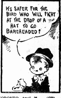
It's safer for the bird who will fight at the drop of a hat to go bareheaded!