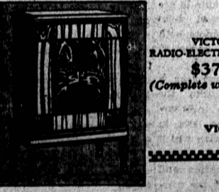
VICTOR RADIO-ELECTROLA RE-45 $375 (Complete with tubes)

The term "Micro-synchronous balance" means that—and more! Slide the control knob over to the right! Now to the left! Every last inch on the dial is a "sweet-spot."