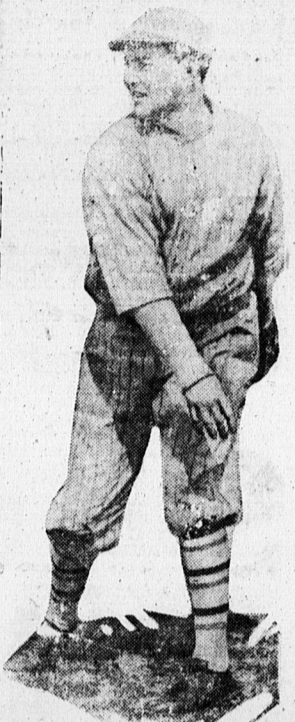
John J. McGraw

Winning moundman of the third game of the World's Series struggle. McGraw is a curve pitcher with almost faultless control.