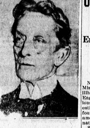
Sir Johnstone Forbes Robertson, famous British actor, who is one of a group of distinguished people who are seeking for the removal of the clause in the Versailles Treaty which lays the responsibility for the war upon Germany.