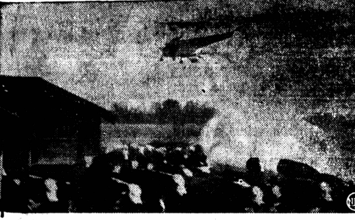
Hovering over a herd of cattle, a helicopter equipped with "Kelley's Koolie Killer", provides a quick and effective insecticide dusting.