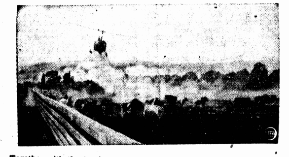
Together with the tractor and plow, the helicopter and its insect spray may become an effective farm tool.

Poulin says a standard airplane dusting fields or cattle is over its working area only seven seconds out of every working minute. The rest of the time because the plane must make wide turns and travel much faster is used up in making approach runs. "We believe," says Poulin, "that we have a machine here that will save the farm a large percentage of the six billion dollar loss he suffers every year from bugs, weeds and rodents. "We'll know for sure by October."