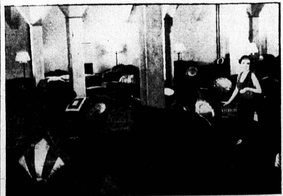
A section of the new Main Floor Showing Living Room Furniture in a Smart New Setting.

Particulars as to the items on sale and other important points of this event will be found in the following pages of this Special Supplement.