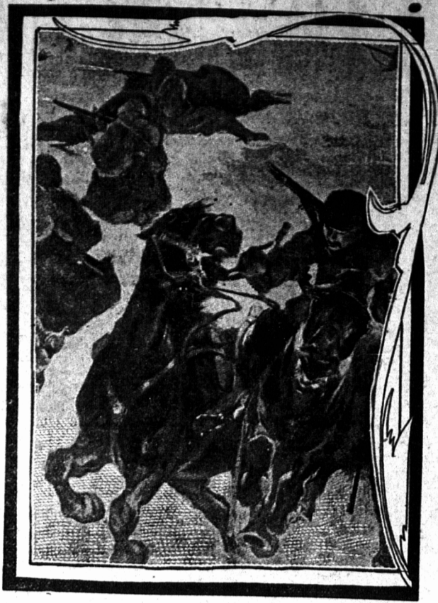
THE JAPANESE CAVALRY SCOUTS HAVE A BRUSH WITH THE ENEMY.

The C. B. C. Recorder remarks that "today the brains of some of our prominent and far-seeing men are waxing hot, advocating a tunnel. . . Those who fight with success for this cause will bestow a merciful kindness on unborn generations for which they will be duly grateful."