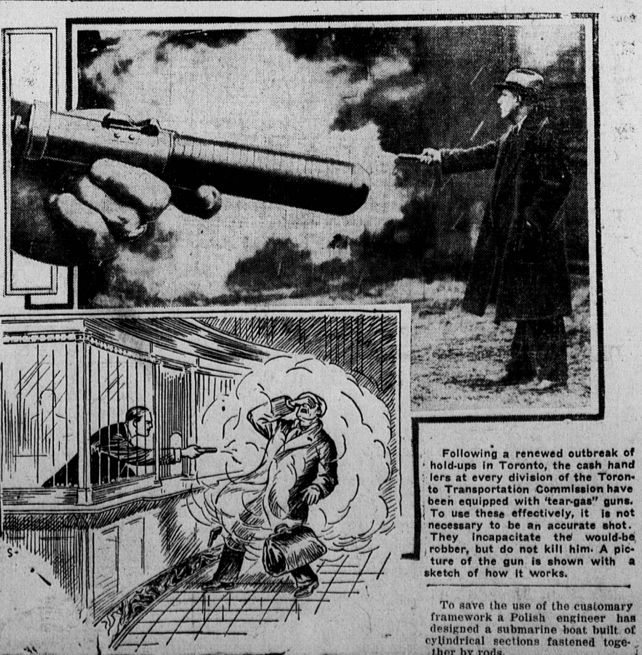
Following a renewed outbreak of hold-ups in Toronto, the cash hand- lers at every division of the Toronto Transportation Commission have been equipped with "tear-gas" guns. To use these effectively, it is not necessary to be an accurate shot. They incapacitate the would-be robber, but do not kill him. A picture of the gun is shown with a sketch of how it works.