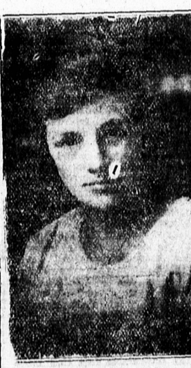
Leader in District No. 2 in The Guardian's Great Competition Contest.