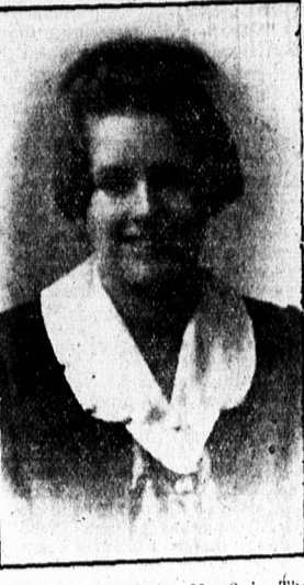
Leader in District No. 2 in The Guardian's Great Competition Contest.