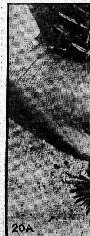
As if to mark the sniper's ambush, there lay an African daisy

Grafton to run along and roll her hoop?" "Can't," Ward grunted. "Ever notice, Major, that money's pretty important in this life? Gail knows Barney's up to his ears in this Loja deal and—"