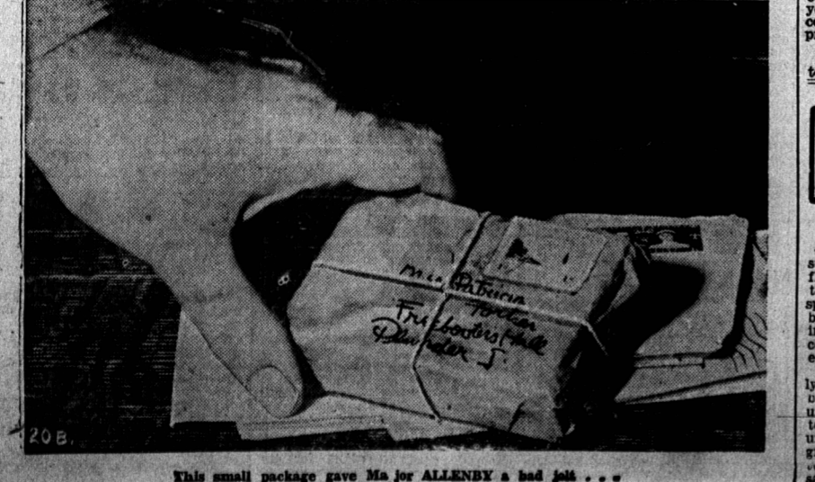
This small package gave Ma for ALLENBY a bad job . . .

HAM AND PEANUT LOAF One cup ground peanuts, 1 cup ground ham, 2 stalks celery (chopped), 1 small onion, minced, 1/2 cup milk, 2 eggs, slightly beaten; 1-2 teaspoon salt, 1-8 teaspoon pepper, 1-2 teaspoon dry mustard. Combine ingredients, mixing well. Turn into greased loaf pan and bake in moderate oven 45 minutes. Serve hot. Approximate yield: 6 portions.