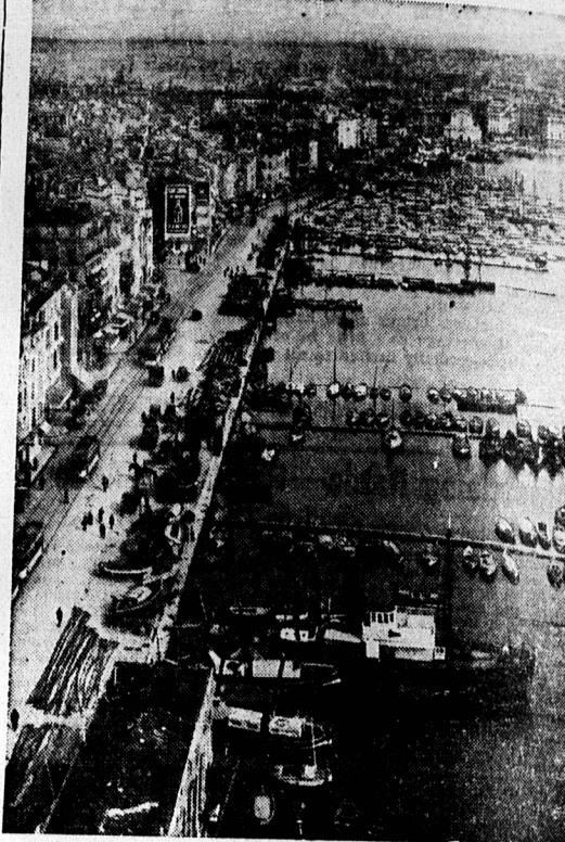
A section of harbor at Marseilles, second largest city in France, where a section of harbor at Marseilles, second largest city in France, were killed, 100 injured in raids. One British merchantman was sunk in the harbor.