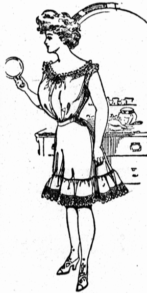
Corset Cover 309—52c Drawers 608—38c