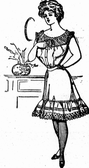
Corset Cover 345—58c Skirt 785—$1.50